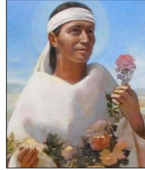
St. Juan Diego