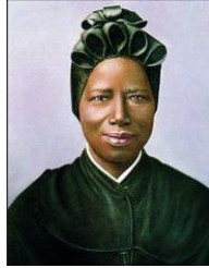
St. Josephine Bakhita