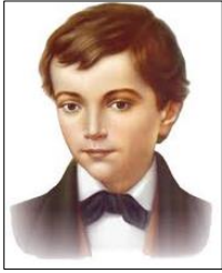
St. Dominic Savio