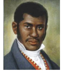
Ven. Pierre Toussaint