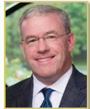
Jeffrey S. Chiesa, Esq. CHIESA SHAHINIAN & GIANTOMASI, PC FORMER U.S. SENATOR AND NEW JERSEY STATE ATTORNEY GENERAL